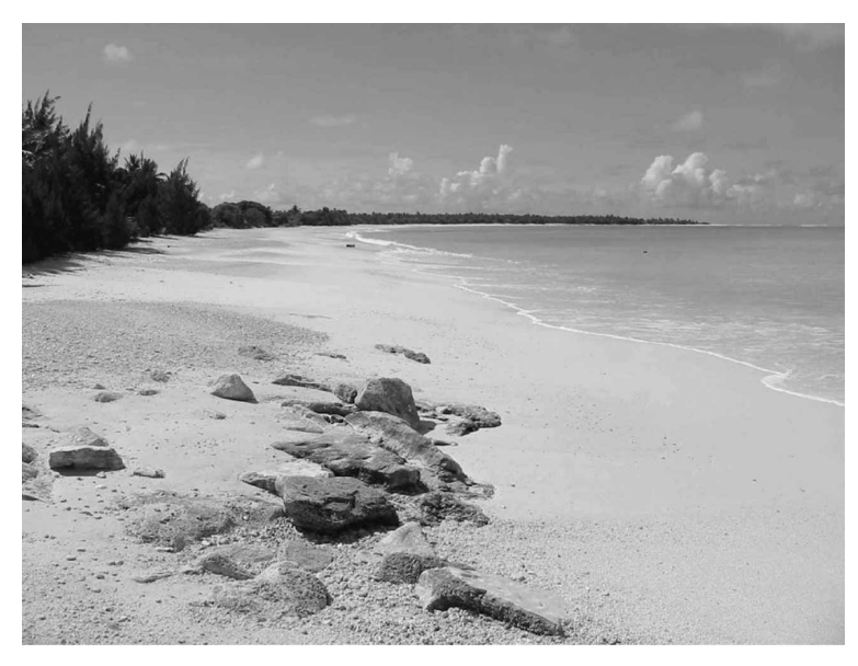
Figure 4. The beach on Bikini.

The presence of beaches is not the only reason Bikini is labeled as a paradise. Bikini's beaches are Edenic because they are tropical and largely uninhabited. One tourist on Bikini exclaimed, "Oh my god, I'm the only one on this beach! I can see as far as I can see and I'm the only one" (2002). These are beaches that belong to a special category of landscape that is significant in the Western imagination: the South Pacific Island. This is a geographic label that connects Bikini to other places. Bikini is thus assumed to share many of the characteristics of other 'South Pacific Islands'. This does not necessarily mean that Bikini is believed to be like Rarotonga or New Caledonia, (or for that matter Moruroa).<sup>(2)</sup> Rather, the term "South Pacific Island" points not as much to a real geographical place as to an ideal setting that is a powerful Western cultural narrative. After all, Bikini's position 11 degrees north of the equator does little to dampen its appeal as a South Pacific Island.