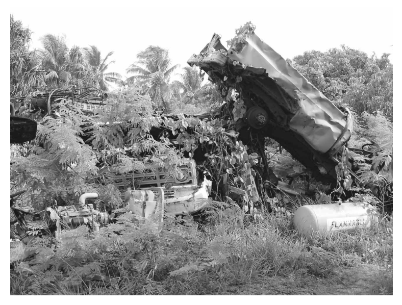
Figure 3. Trash on Bikini.

that is being denied so as to place the nature of Bikini outside time. As with the other erasures of history there are, of course, political consequences.