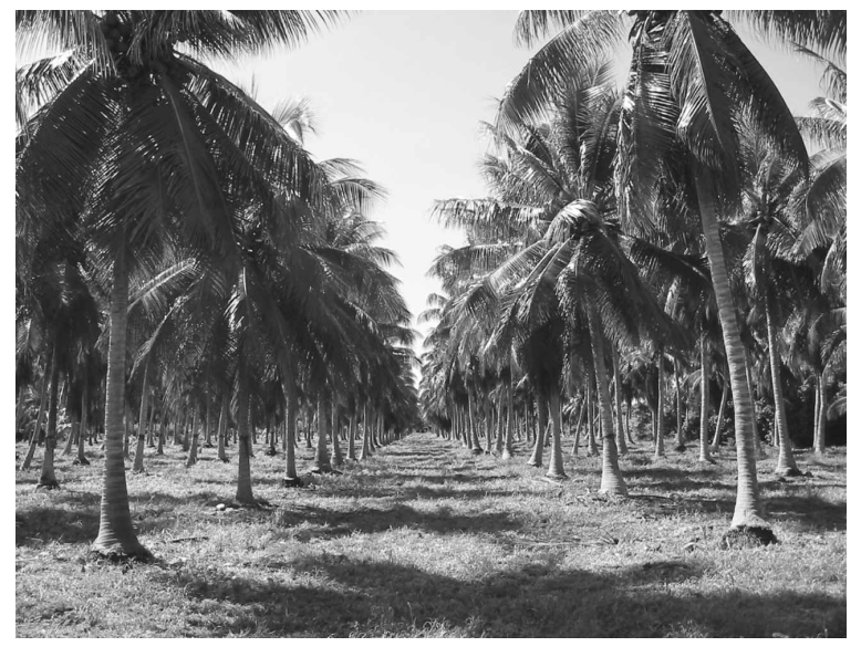
Figure 2. Palm trees on Bikini.

There has been, however, another erasure of history on Bikini. Unlike in 1946, it is not the impact of indigenous people on the natural environment being erased, but rather the modernist project of nuclear-weapons testing. It is the history of moderns