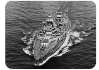
Min Depth 36m/118ft Max Depth 57m/187ft Length 171m/561ft

Her services earned the Anderson ten battle stars during the war. Her fuel capacity included 168 barrels of diesel and 2929 barrels of oil. When she was sunk by the atomic blast of Test Able, she was at 95 percent capacity. The destroyer now lies in Bikini's lagoon resting on her side.