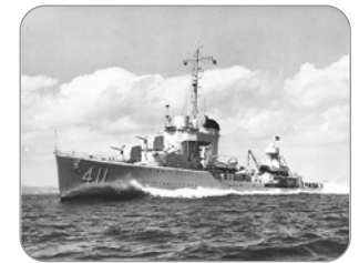
Min Depth 45m/148ft Max Depth 52m/171ft Length 105m/344ft