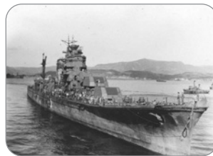
Min Depth 49m/161ft Max Depth 53m/174ft Length 162m/531ft