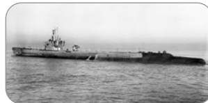
Min Depth 44m/144ft Max Depth 50m/164ft Length 95m/312ft