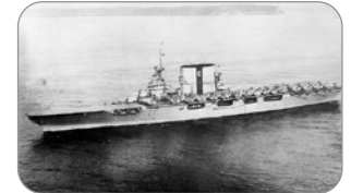
Min Depth 21m/69ft Max Depth 51m/167ft Length 268m/879ft

USS Saratoga now rests 50m/167ft below the water in the lagoon at Bikini. The bridge is accessible at 12m/40ft with the deck at 25m/82ft. The bombs and Helldivers are all on display with their controls and dials.