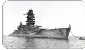
Min Depth 28m/92ft Max Depth 54m/177ft Length 215m/705ft

IJN Sakawa was the only ship of its class to survive World War II. The Sakawa's short-lived career meant she never left Japanese waters until after the war. In August 1945, she was surrendered to the US Navy and used to repatriate Japanese troops. After being transferred to Bikini Atoll for Operation Crossroads, Sakawa was sunk by the first nuclear blast, Able. She now rests in an upright position on the sandy bottom.