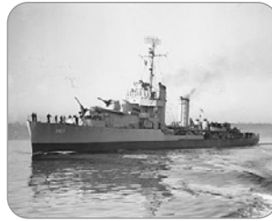
Min Depth 36m/118ft Max Depth 51m/167ft Length 103m/338ft

The Baker nuclear blast eventually sunk the Apogon. She now lies at the bottom of the lagoon at Bikini Atoll. Sitting perfectly upright, she looks ready to make for the high seas.