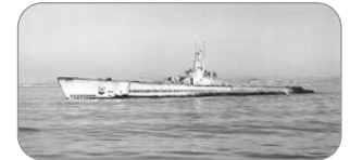
Min Depth 49m/161ft Max Depth 53m/174ft Length 95m/312ft

During Operation Crossroads, Carlisle's fuel capacity was at 95 percent. Sunk by Able, she was split wide open, making the ship a magnificent penetration dive. Sitting upright on the sandy bottom, the USS Carlisle is guarded by an impressive school of skip jacks. Most of the time, there is also a shark who sits on the ship.