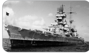
Min Depth 0m/0ft Max Depth 35m/115ft Length 212m/696ft

During May 1945, when Germany collapsed, the ship was turned over to Britain's Royal Navy. Eventually, Prinz Eugen was given to the US Navy who kept her as a war trophy. Prinz Eugen was assigned to Operation Crossroads and took part in the Bikini Atoll tests. She survived the atomic blasts and was taken to Kwajalein Atoll, finally capsizing in December 1946. There the Prinz Eugen remains, still partially visible above the surface of the water.