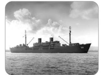
Min Depth 41m/135ft Max Depth 52m/171ft Length 129m/423ft